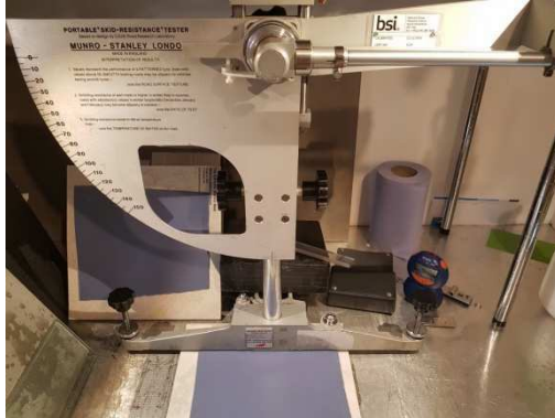
Image 2. Test surface